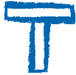
Food here if you work