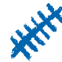
You'll be cursed out